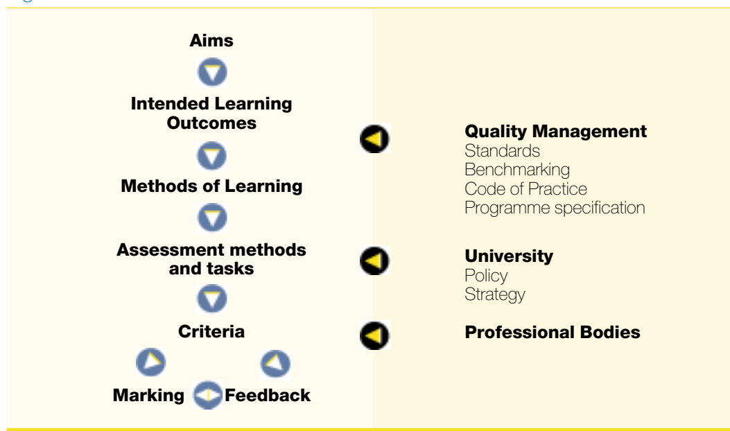
Figure 2: External influences on assessment

An expanded version of the model is shown in Figure 2. It shows the connections between the model and the Quality Assurance Agency (QAA) approach to evaluation. Whilst some of us may have reservations about the micro-management techniques of the QAA, the model does facilitate the fulfilment of its requirements. The approach of the QAA is authoritarian: it is about X doing things to Y and Z judging them. But within its straitjacket, it is possible to build in some freedom to learn.